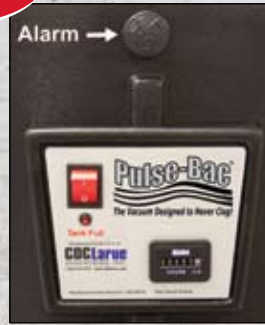
Tank Capacity Sensor